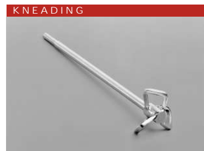
Butterfly impeller ø mm. 70