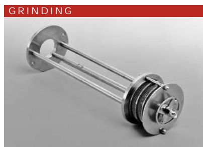
Grinding cage for refining