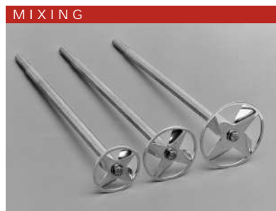
4-blade turbine impellers ø mm. 55 - 65 - 80