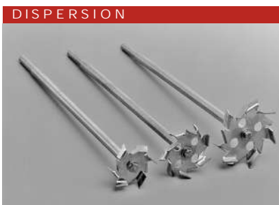
Toothed impellers ø mm. 55 - 65 - 80